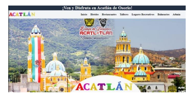
Figure 5 Home screen

The home screen shows the categories that can be visited by the user.