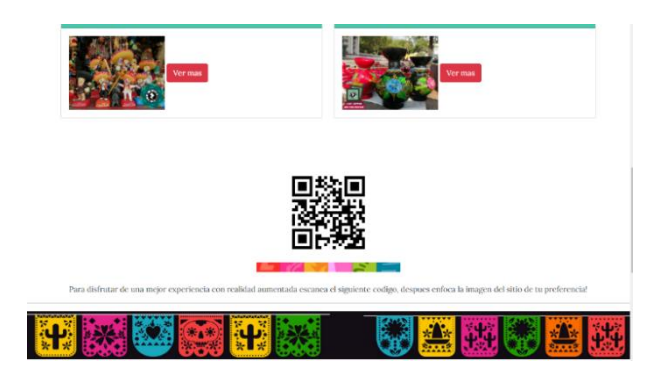
Figure 7 Workshops

This section shows an image of the tourist site and its geographic location.