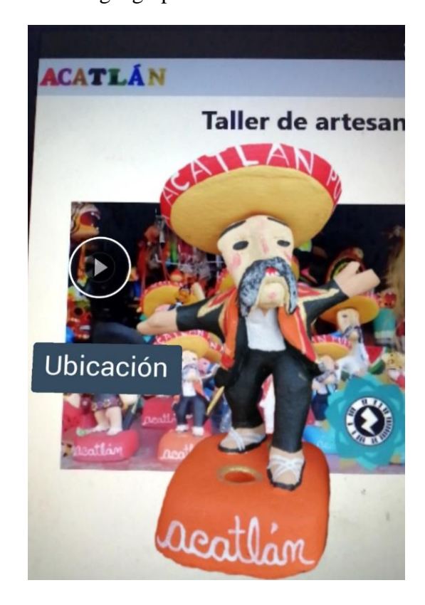
Figure 9 Augmented reality image

When focusing on the image of the tourist site, an augmented reality image is displayed along with an audio description of the site and its geographic location.