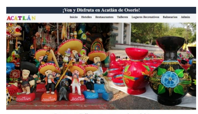
¡Encuentra Talleres para tu proximo viaje!

Figures 6 and 7 show interfaces of the workshops category, in this section you can visualize in detail the information about the handicraft workshops, which is an activity that characterizes the municipality of Acatlan.