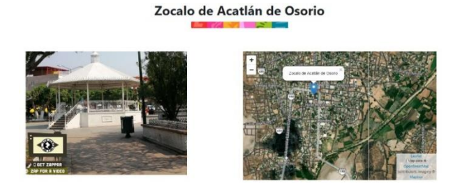
Figure 8 Geographical location of the tourist site

This section shows an image of the tourist site and its geographic location.