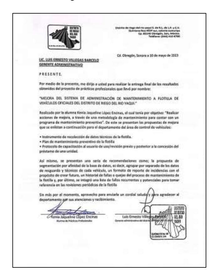
Figure 5 Project completion letter

For the delivery-reception of results to the client, a completion letter was prepared for the closure of the project, it was signed, validating the delivery and fulfillment of the proposed objectives as shown in figure 5. The Delivered products were: Critical data collection format of the object under study, list of recurring failures, maintenance program and user training protocol. See letter in Figure 5.