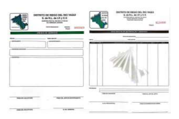
Figure 1 Service order format and materials and service requisition format

In this first step, it was found that currently the official vehicle fleet administration system follows a manual documentary process (paper and pencil) and that it also omits a series of important data, such as: Vehicle model, type of fuel use, maintenance history, engine, description of activities carried out, criteria for scheduling maintenance, maintenance projections, among others; for which they were added in the improvement proposal to the maintenance management system; as well as it was possible to observe that the operators register the failures and send them to the vehicle control offices to issue the order. One of the reports is used to issue service orders for the units and the following is implemented for material requirements (see Figure 1).