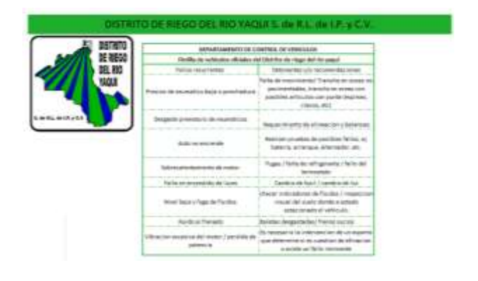
Figure 2 List of recurring failures

After collecting the pertinent data and supported by the interview with the inspector, as shown in figure 2, a list of recurring failures that the fleet has presented during its operation was created; This also includes a series of possible causes that would have originated these recurring failures, which helps to diagnose the breakdowns or breakdowns that each of the vehicles could present to be taken into account in periodic reviews and maintenance planning.