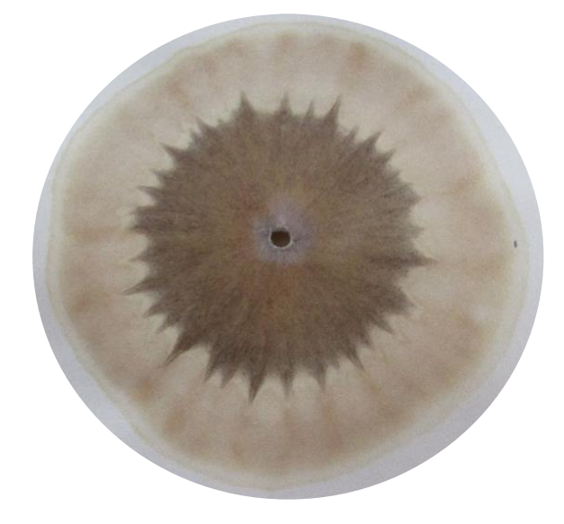
Figure 4 Soil in the first week after applying bocashi based on native microorganisms

In figures 2b and 4 the state of the soil can be seen in the first week after applying the organic fertilizer (bocashi), in relation to the central area there is a very scarce white creamy color that fades to integrate with the following zones, likewise, there is presence of organic matter with minerals integrated in the soil, it can mentioned that because this sample be corresponds to the first week after applying bocashi, there is little evidence of enzymatic factors resulting from biological activity, since it is related to the metabolic demand of microbial biomass (Defrieri et al., 2005).