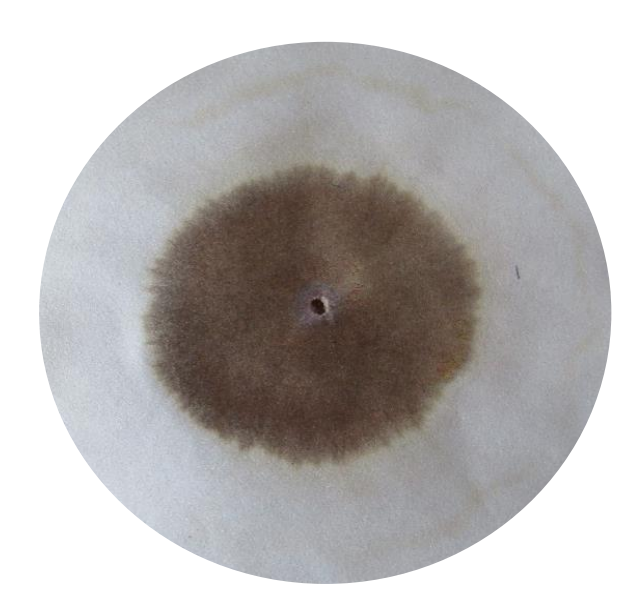
Figure 3 Soil analysis before applying any amendment

In figures 2b and 4 the state of the soil can be seen in the first week after applying the organic fertilizer (bocashi), in relation to the central area there is a very scarce white creamy color that fades to integrate with the following zones, likewise, there is presence of organic matter with minerals integrated in the soil, it can mentioned that because this sample be corresponds to the first week after applying bocashi, there is little evidence of enzymatic factors resulting from biological activity, since it is related to the metabolic demand of microbial biomass (Defrieri et al., 2005).