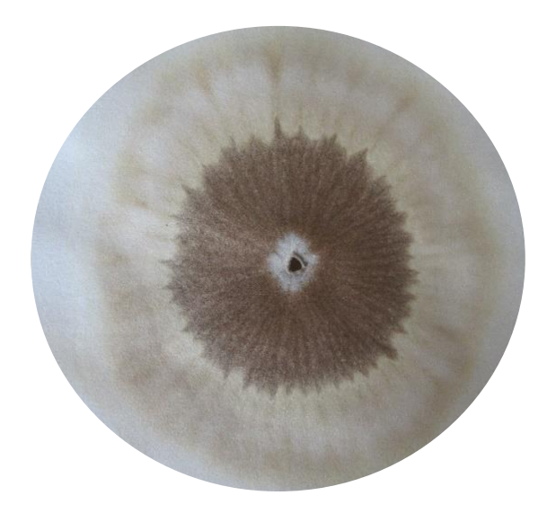
Figure 5 Soil in the second week after applying bocashi based on native microorganisms

It fades and integrates with the following zones. It can be seen that minerals and organic matter are integrated in the soil, indicative of the biological activity, finally due to the very wavy clouds of the external zone, some enzymatic activity begins, it is well known that the decomposition of organic matter depends of the cellular production of microbial enzymes (Quintero, 2014)