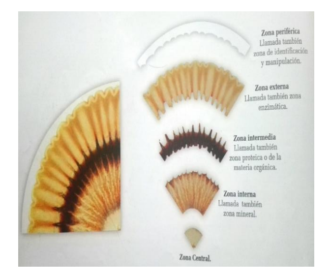
Figure 1 Main areas of a chromatogram ( Restrepo and Pinheiro 2011 )

The interpretation of the results was carried out in accordance with that indicated by Restrepo, J. and Pinheiro, S. (2011). Taking into account that the description is made based on the areas that compose it, its size, shape and the colors revealed. The zones are five, from the center outwards: central zone, internal zone (mineral), intermediate zone (organic matter), external zone (enzymatic) and management or peripheral zone (figure 1).