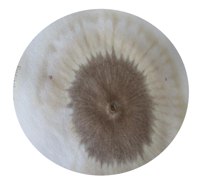
Figure 6 Soil in the third week after applying bocashi based on native microorganisms

On the other hand, Ramos, Terry, Soto and Cabrera (2014) mention that bocashi incorporates organic matter and essential nutrients into the soil, such as nitrogen, phosphorus, potassium, calcium, magnesium, iron, manganese, zinc, copper and boron; which improve the physical and chemical conditions of the soil, which stimulates the microbial life of the soil and the nutrition of the plants and a chromatogram is a guarantee seal that records the quality of the soil's health and its relation to the biological value produced (Restrepo and Pinheiro, 2011).