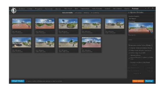
Figure 4 Imported image in the "standard panorama"

This stage we seek to obtain the 360 panoramic photographs taken at the university applying the corresponding image correlation processes so that we can execute them on the virtual tour. Grouping stage in the virtual tour program. To use the 3DVista Virtual Tour program correctly it is necessary to import all the images that were used, in the form "Standard Panorama". (Figure 4)