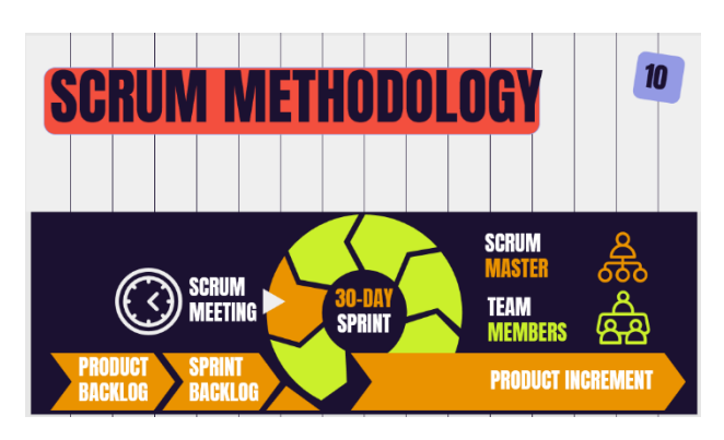
Figure 8 Scrum Methodology

Within this framework and in the context of our project, we find 2 roles, the "Scrum Master" and the "Team Members" The "scrum master" has the role of moderator, we could say that he is the leader of the project, however he is not the person in charge of giving orders but rather helping the "team members" to understand the needs that the final product must meet.