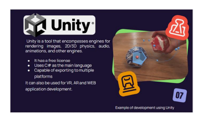
Figure 7 Unity as a graphics engine

For all those reasons and more the better option to develop the project is Unity as a graphics engine showed in the figure seven.