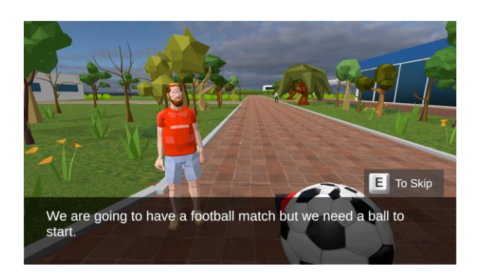
Figure 12 Screenshot solving puzzles in the escape room dynamic