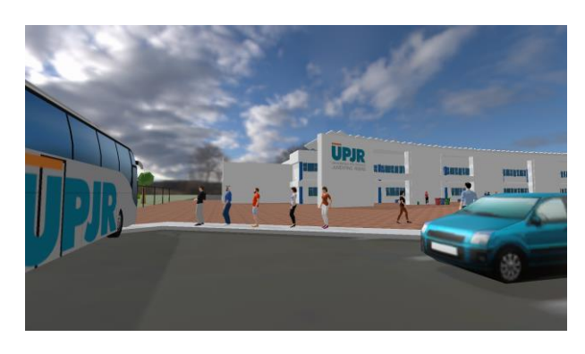
Figure 13 Screenshot of the virtual tour route of the UPJR University

Whit this we are demonstrating that the gamification helps to encourage and motivate the attention that students pay to the content. With this learning model, it is about overcoming the barriers imposed by the global situations that we have had to go through, in addition to are traditional methods, which characterized by the passive reception of the information provided or dictated by the teacher. In this sense, gamification is an alternative to these passive methodologies, installing the student as the protagonist of their own learning.