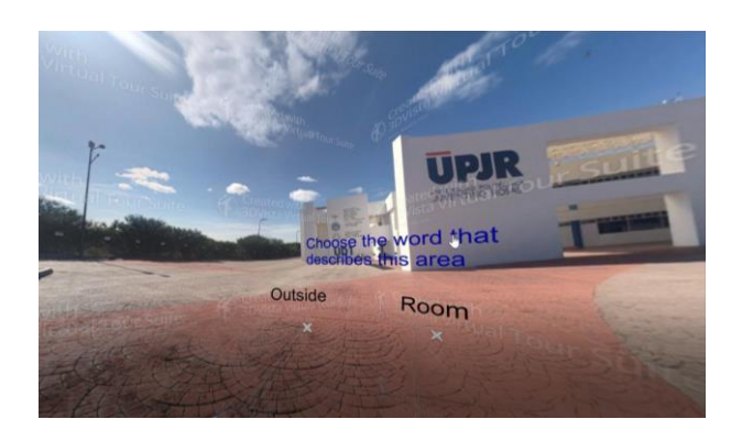
Figure 3 Screenshot of the virtual tour route

You can visualize and answer by increasing vocabulary and grammar as when you go on the tour and throw a question where you learn how it is structured in English language just as when you answer you make use of the subject, verb, some helper to be able to answer the question. In addition, objects such as a table, chair and even the material they occupy in the career. In order to achieve this, a series of designs were made where it was convenient to generate the question helping those who follow the path to remember easily, this with the software that provides us with unreleased ways to create, imagine inserting shapes and designs to achieve an original work.