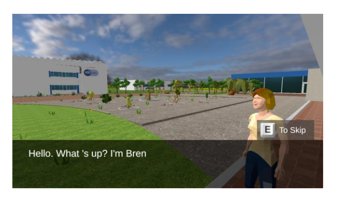
Figure 10 Screenshot when you start a basic conversation with a NPC about the presentations topic