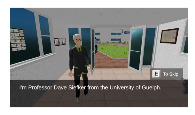
Figure 11 Screenshot of a conversation about the presentations topic and then solve a puzzle