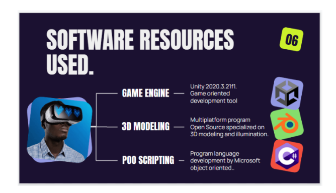
Figure 6 Software resources used

The software resources used are showed in the figure six.