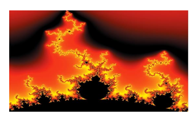
Figure 1 Title and Source (in italics)

Should not be images-everything must be editable.