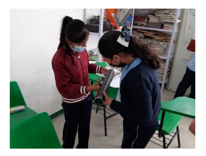
Figure 3 Construction of the homemade telescope

On the other hand, the students elaborated a homemade telescope for sky observation and made the representation of celestial bodies as part of the group project, with the help of the Arloon Solar System application, where they applied Science, Engineering, Arts and the use of Technology from the STEAM areas.