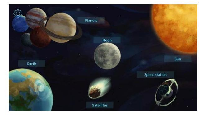
Figure 4 Arloon Solar System application