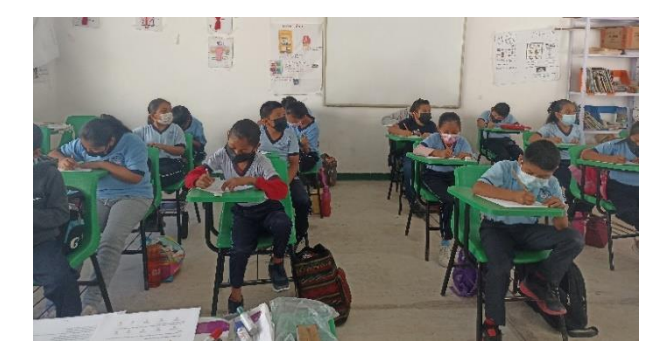
Figure 8 Application of the pre-test

During the sessions used for the intervention of the study, in the first session, the pre-test was applied to measure the students' previous knowledge about the Solar System; in various sessions in the intervention phase, the survey was applied for the study on the implementation methodology of the STEAM in the development of the group project; and in the last session, the post-test of the study was applied to obtain the results of the students' learning.