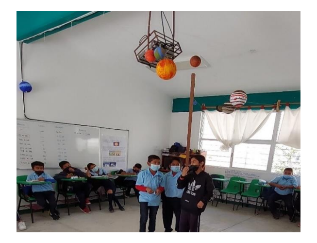
Figure 7 Exhibition of what was learned during the development of the group project.