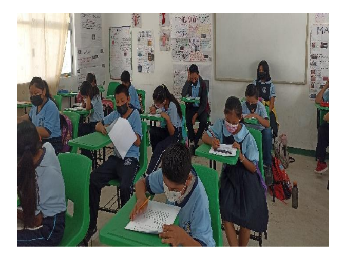
Figure 10 Post-test application